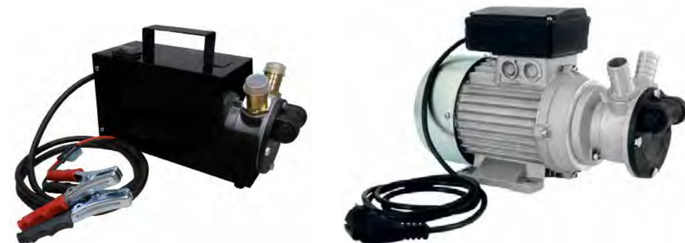
Art. 091-5490-060 Electric pump for oils and lubricants transfer 12-24V 45l/min (12V) 60 l/min (24V)

Power cable 2 m length, with pincers and protection fuse